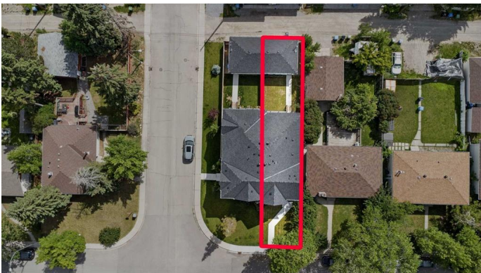
3704 42 St SW, Calgary, AB

Main Floor Exterior Area 942.00 sq ft Interior Area 896.04 sq ft