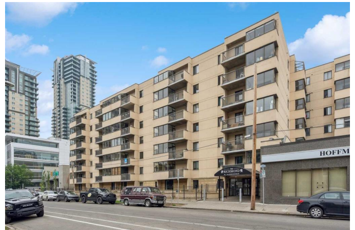
214 111 14 AVE SE - 06.12.2025 Main - 823.17 sq.ft / 76.47 m 2 RMS Area - 823.17 sq.ft / 76.47 m 2