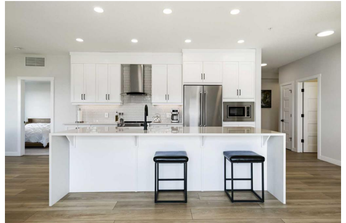
312, 55 WOLF HOLLOW CRESCENT SE REC-MEASUREMENT STANDARD - CALGARY AB MAIN LEVEL (AG) - 1134.96 Sq Ft. / 105.44 m² TOTAL ABOVE GRADE RMS SIZE - 1134.96 Sq Ft. / 105.44 m²

You know that feeling when you are on holidays? When you walk into your high end hotel room and take a big deep breath and then a huge sign of contentment resting your gaze on immaculately maintained and gorgeous surroundings? Then you take a step out to your over sized and spacious balcony to sit down and enjoy the golden hour and wonderful view, all the while thinking...I could live here. Well...here's your chance! Welcome to the Bow360 at Wolf Willow where you are invited to explore almost 1200sqft of luxury living. This stunning CORNER UNIT overlooking the greenspace and park will invite you in and have you feeling like you are in vacation mode immediately upon entering. The 9ft ceilings and spacious foyer opens up to a thoughtfully designed open floor plan that introduces you to TWO BEDROOMS plus DEN complimented with 2 FULL BATHS showcasing stunning black hardware with a professionally designed interior colour palette. Designed by award winning architects S2 you will enjoy the expansive living room with beautiful feature fireplace with floor to ceiling stone and luxury vinyl plank flooring through out the main living and designated dining area which is situated overlooking the deck and greenspace. Corner lot window treatments gives you additional over sized windows that are framed in by custom window treatments and the radiant heating keeps you nice and cozy during the cooler months while the central air vented through out the entire unit