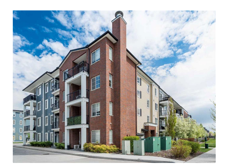
7309-151 Legacy Main St SE, Calgary, AB

Don't miss your chance to call this homeâ€"schedule your showing today!