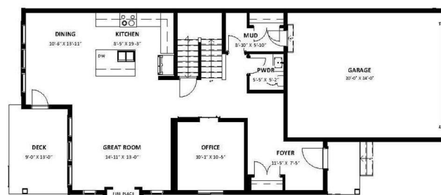
MAIN 1,085 SQ.FT. GARAGE 477 SQ. FT.